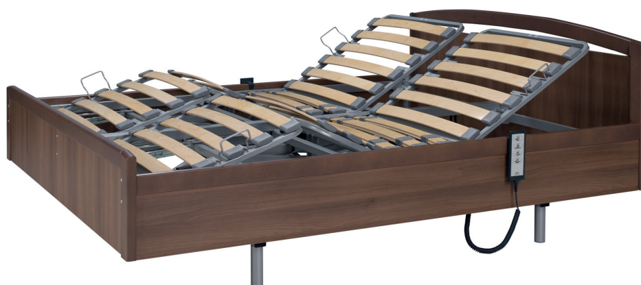
PB 533 DB (nut frame)